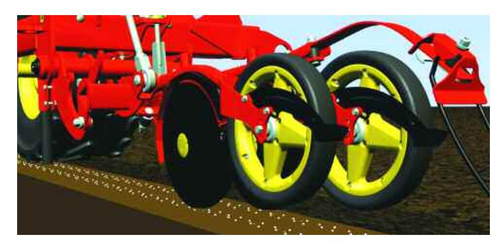
Modern combined drills typically place fertiliser in a narrow band close to the seed

• "You need to mount an applicator onto an existing cultivator/subsoiler to apply it, but results suggest that it's highly beneficial to do so."