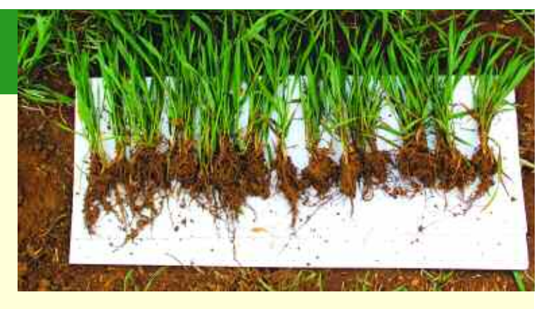
Wheat plants treated with Compost Tea (left) are claimed to develop better roots in autumn.

"Because the young plant has only small roots it's important to place the nutrient in close proximity so that it can be easily accessed, typically within 3mm of the seed, and in a suitable format, such as a micro-granule. This is essential in the case of phosphorus. ▶